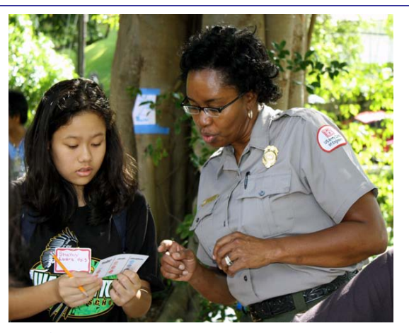
Military Support , including major construction programs in support of the U.S. Army and Air Force, their service members and families.

Environmental Services, includes programs that protect endangered species and cultural resources at civil works projects and military installations, and the management of the Department of Defense's Formerly Used Defense Sites (FUDS) program.