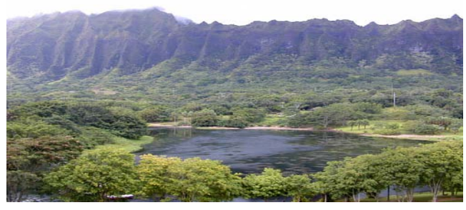
Kaneohe-Kailua Area Flood Control Project, Island of O`ahu. The project consists of a dam and reservoir on Kamo`oali`l Stream, channel improvements at the mouth of Kaneohe Stream, and a public recreation park named Ho`omaluhia which means (in Hawaiian) "to make a place of peace and tranquility".

Civil Works includes commercial port and small boat harbor development, flood control, beach erosion control and shoreline protection. The International and Interagency Services program enables the District to partner with local, state, and federal agencies and, in some cases, foreign nations.